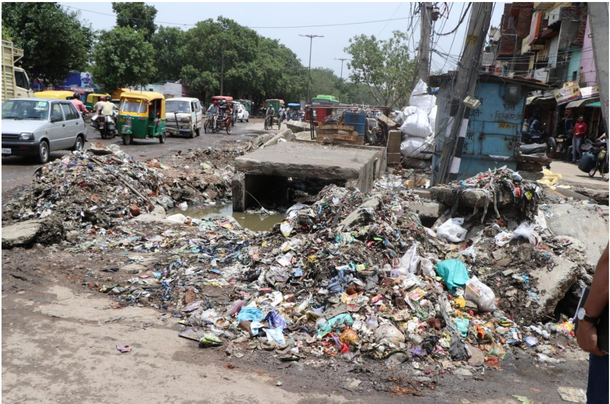
Lal Bagh, opposite Hans cinema: PWD Drain