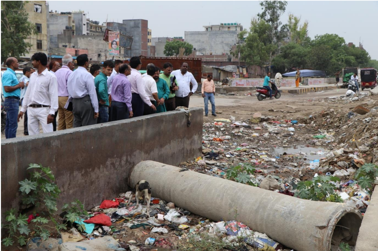
Gazipur, near cremation ground: The photographs below are of cow dung which is not being cleaned by the EDMC