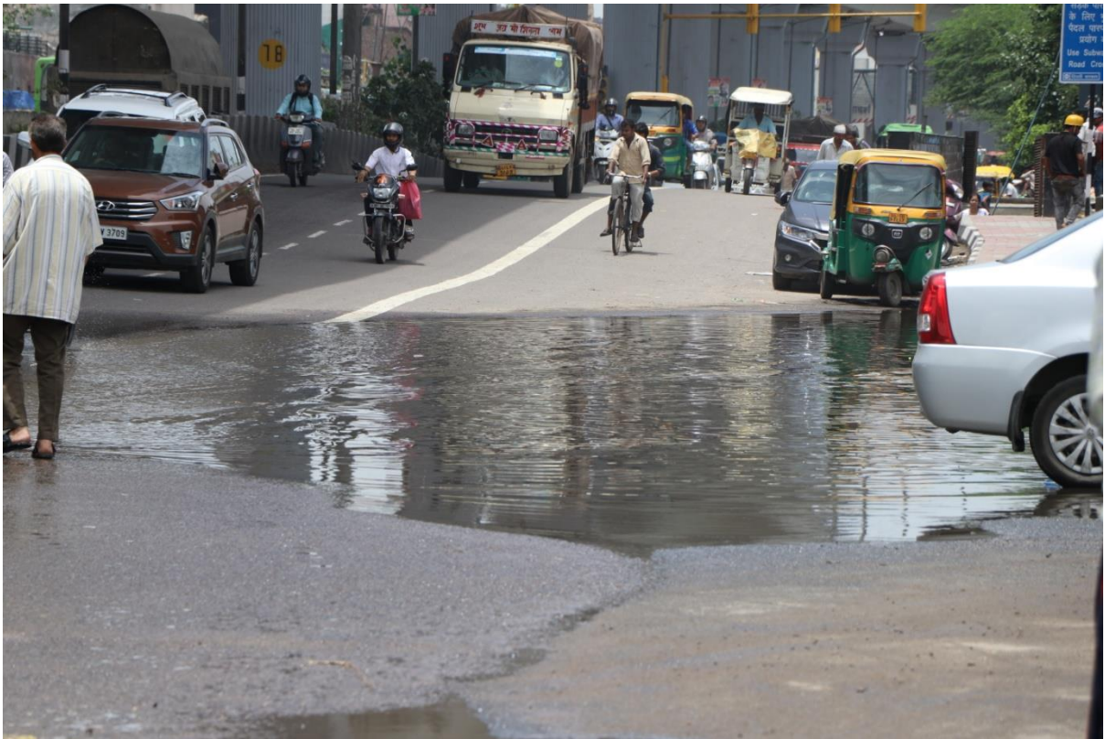
Near azadpur underpass