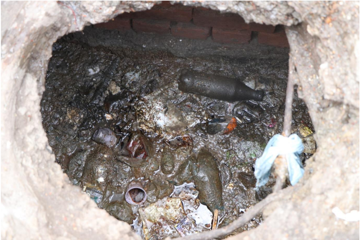
Geeta Colony, near DC office: The drain comes under EDMC